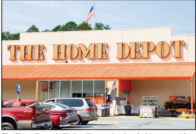
The Home Depot in Blairsville was the site of a bizarre accident involving a truck running a woman completely over in the parking lot Sept. 29.

He initiated his turn without realizing that a woman was crossing from the store entrance to the beginning of